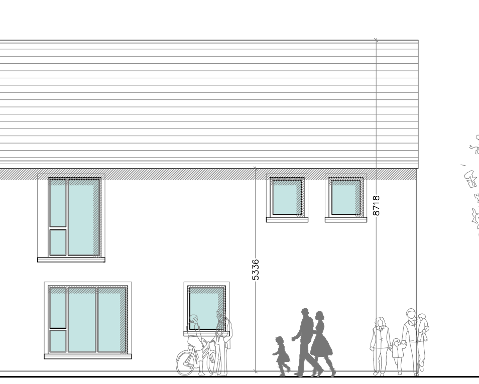
Proposed Rear Elevation SCALE 1:100 @ A3

* FINISHED FLOOR LEVELS - REFER TO SITE LAYOUT PLAN