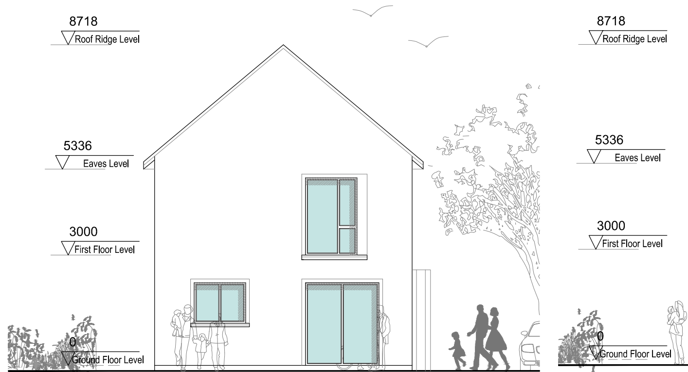
Proposed Side Elevation SCALE 1:100 @ A3

* FINISHED FLOOR LEVELS - REFER TO SITE LAYOUT PLAN